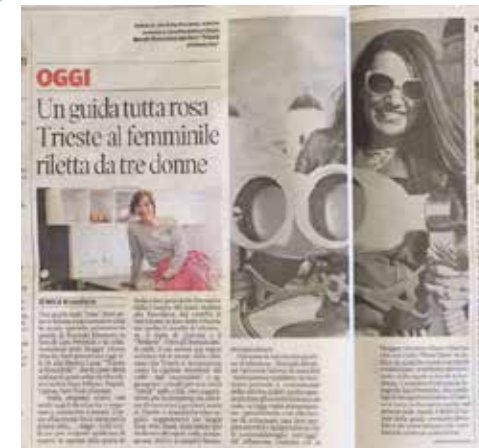
An article on Trieste's “Il Piccolo” newspaper, 17th May 2017