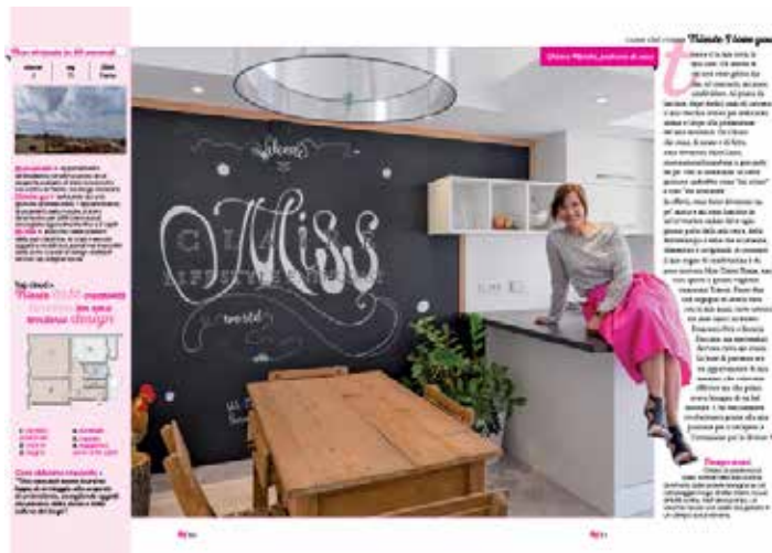
Home of the month in July 2017 edition of “Home”